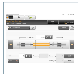
User-friendly software and intuitive operation via the 10" color touch screen.