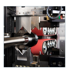
High-precision cutting unit with SmartDetect quality-monitoring system.

The intuitive and standardized user interface of the S.ON software simplifies operation; numerous preset cable applications reduce the programming time. The module-based software supports parallel machine processes.