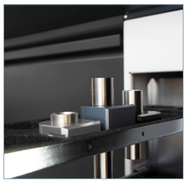
Color-coded guides simplify operation and reduce setup times.