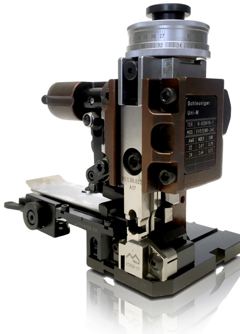
Uni-M Side Feed